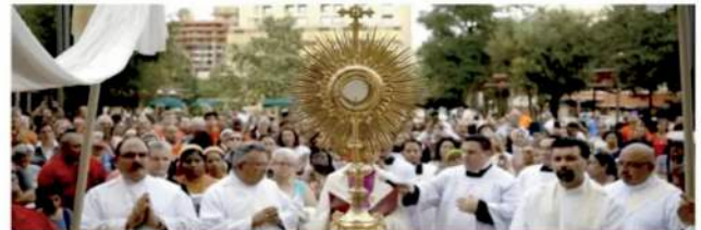
EUCCHARISTIC PROCESSION LED BY ARCHBISHOP GUSTAVO

SATURDAY † JUNE 6, 2026 SAN FERNANDO CATHEDRAL 5:00 PM VIGIL MASS