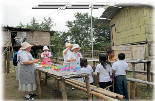
The new mission

Of the thirty-seven sisters who volunteered for this work, four sisters were chosen to go to Ecuador. These four sisters attended an intensive course for new missionaries offered by the Columban Fathers in Seoul. In preparation for the Golden Jubilee of the Korean Province, the sisters arrived in Guayaquil in March 2008 and studied Spanish at the Catholic University, Universidad Catolica De Santiago De Guayaquil, for a year. After the completion of their formal language studies they moved to Pedro Carbo. Many people comment on the joy and peace these sisters bring to this area. It is a mission of hope and sharing deeply the love of the Lord. One of the sisters said, "Even though I am living in a different culture and a different land I believe that the Lord's love is strong and will help us become one with the people."