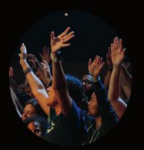
PART 1 Seeking God's Glory in Worship (6:30 pm)

Our Lady of Grace Church Madonna Room 223 E Summit Ave San Antonio, TX 78212