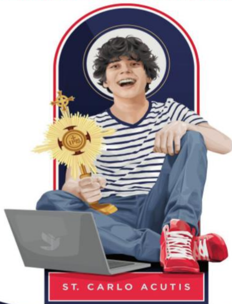
ST. CARLO ACUTIS

The more Eucharist we receive, THE MORE WE WILL BECOME LIKE JESUS, so that on earth we will have a foretaste of heaven.