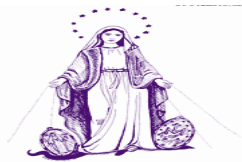
Our Lady of Grace