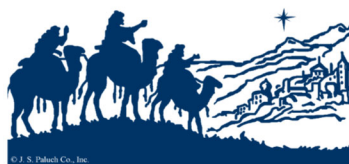
The Epiphany of the Lord January 8, 2023

The English translation of the Psalm Responses from the Lectionary for Mass © 1969, 1981, 1997, International Commission on English in the Liturgy Corporation. All rights reserved.