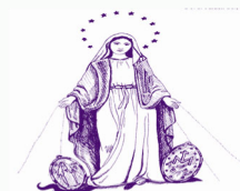
Our Lady of Grace