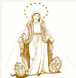
Our Lady of Grace

We will have four priests available to hear your confessions.