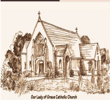
Our Lady of Grace Catholic Church