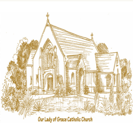
Our Lady of Grace Catholic Church