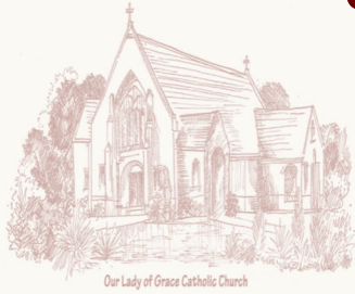
Our Lady of Grace Catholic Church