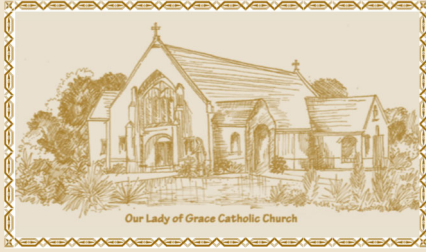
Our Lady of Grace Catholic Church

223 East Summit Avenue San Antonio, Texas 78212