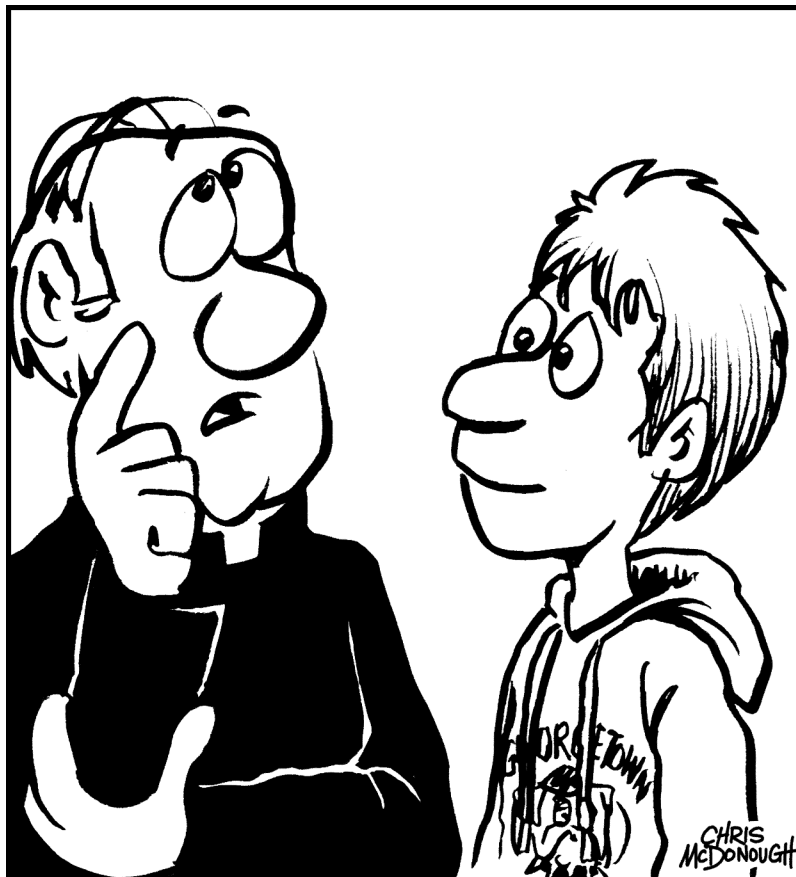
"Yes, Judas could be seen as 'The Weakest Link' but I doubt Jesus said at the Last Supper, 'Good-bye!' "

THANK YOU to all the business people who advertise in our Sunday bulletin. Your advertising helps to provide our bulletin free of charge each week. We are very grateful for this continuous support and hope everyone will patronize these businesses.