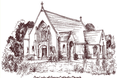
Our Lady of Grace Catholic Church