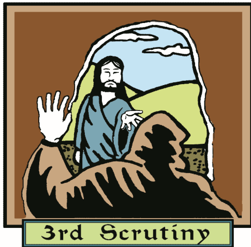
© J. S. Paluch Co., Inc.

Call the parish office at least six months in advance.